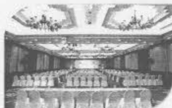
Level 2: Meeting Rooms