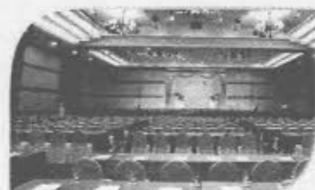
Level 3: Exhibition and Poster Boards