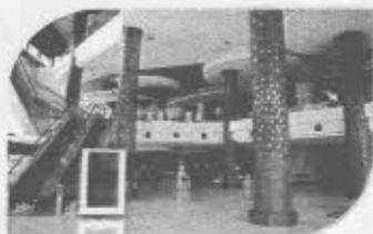
Level 1: Registration and Luncheon